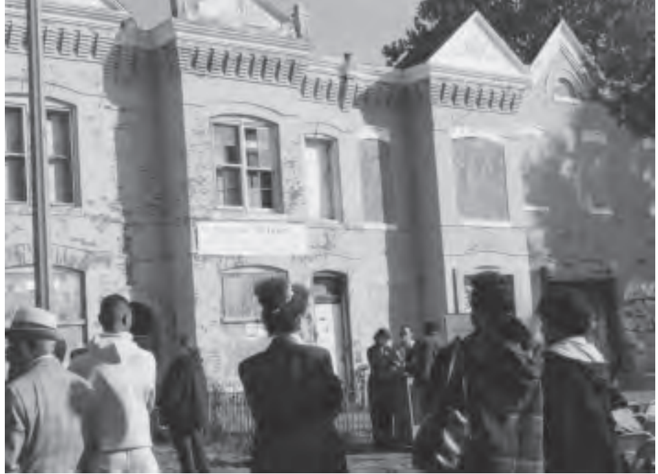
"Their vision is to make a difference in their city by making a positive difference in the lives of the people."

In addition, Refuge of Hope has also provided educational training and humanitarian relief via humanitarian trips to Ghana, Togo, Benin in West Africa and Guyana, South America where the pastors have worked alongside the local people in improving their living environments through emergency relief.