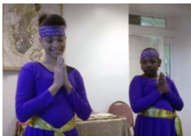
Praise dancers at Saturday Conference